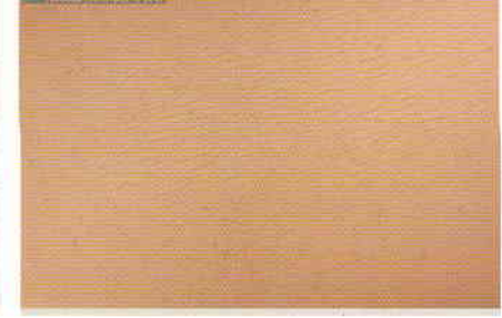
PRECITEX XP Apron