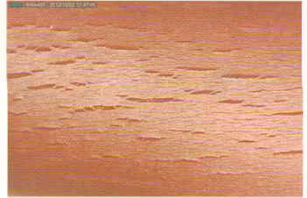
Regular Apron Type B