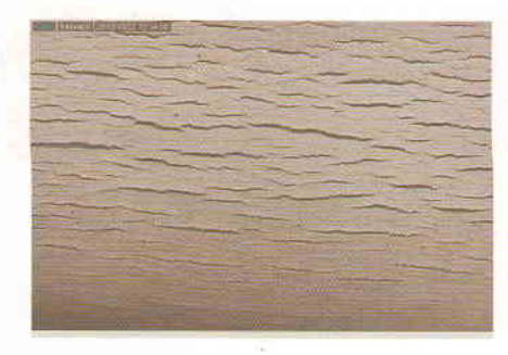
Regular Apron Type A

XP apron in comparison with other types after exposure to Ozone of very high concentration:-